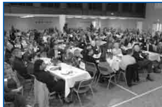
Photos from top: (1) 2009 Birthday Breakfast (2) Bluebird Café