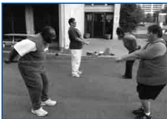
Journey to Health Participants

Faith Family's health and wellness program Journey to Health has had a busy and successful first six months. Business is booming as they say, and the number of patients in need of the program continues to grow with each passing day.