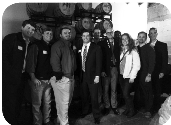
Friends of Faith Family gather at Corsair Distillery.