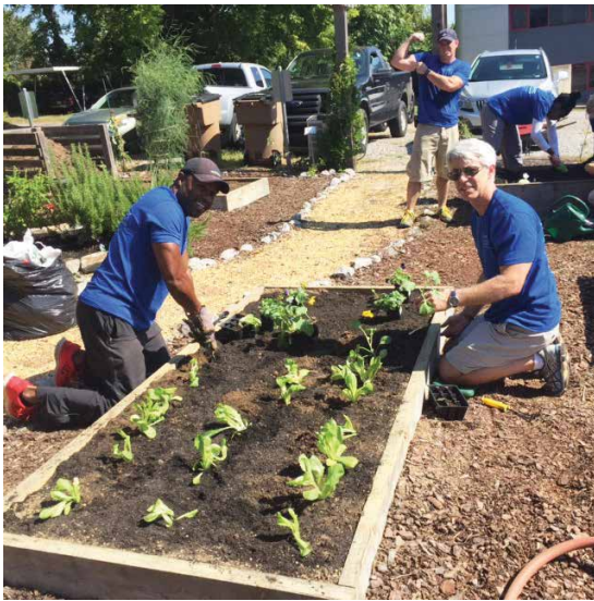
Thanks HCA for coming out to help in the wellness garden!