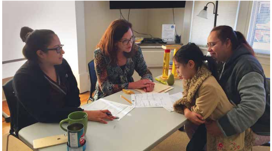
A translator and our on site dietitian chat with a patient and her daughter about making healthy choices.