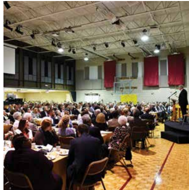
A packed house!