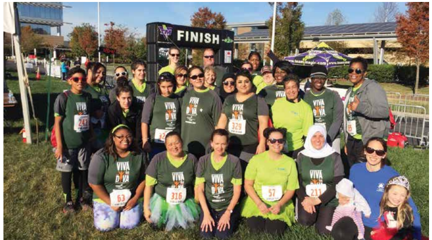
Journey to Health had a team of 32 runners in the Viva la Diva 5k!